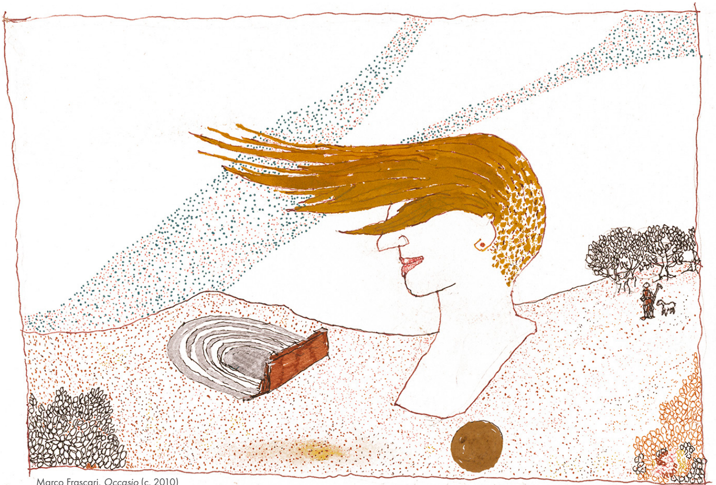
Marco Frascari, Occasio (c. 2010)

Architecture is protean. If asked directly to reveal herself, she will offer instead some disguise, a personification by which to elude us. However, if we remember that the role of the architect is to make tangible what is intangible, we can solve the puzzle and rediscover the image embodied in it, the corporeality of theater and the theater of corporeality.*